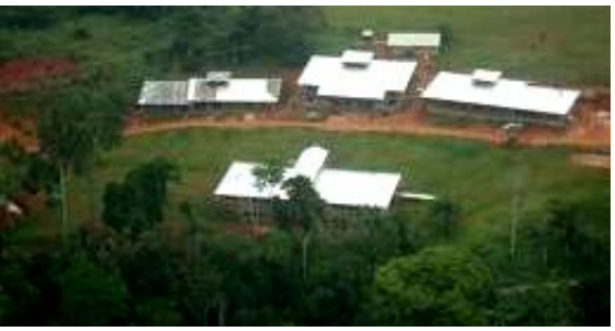
Arial view at RFIS. Google Earth coordinates: 3°48'5.55"N / 11°33'18.68"E

The Rain Forest International School is situated at the edge of Cameroon's capital Yaounde, a city with more than 2 million inhabitants.